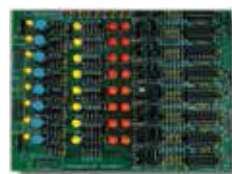
Solid State Technology